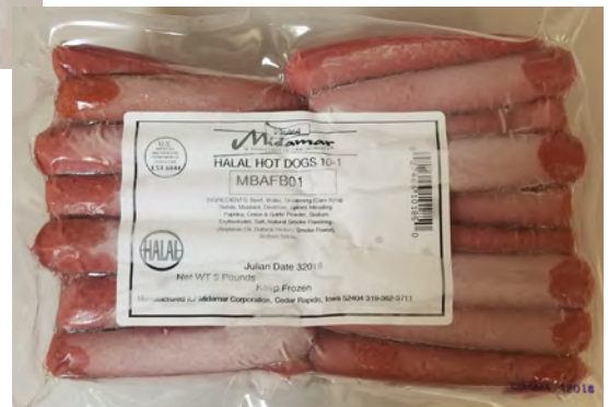
Individual Package Label ↓